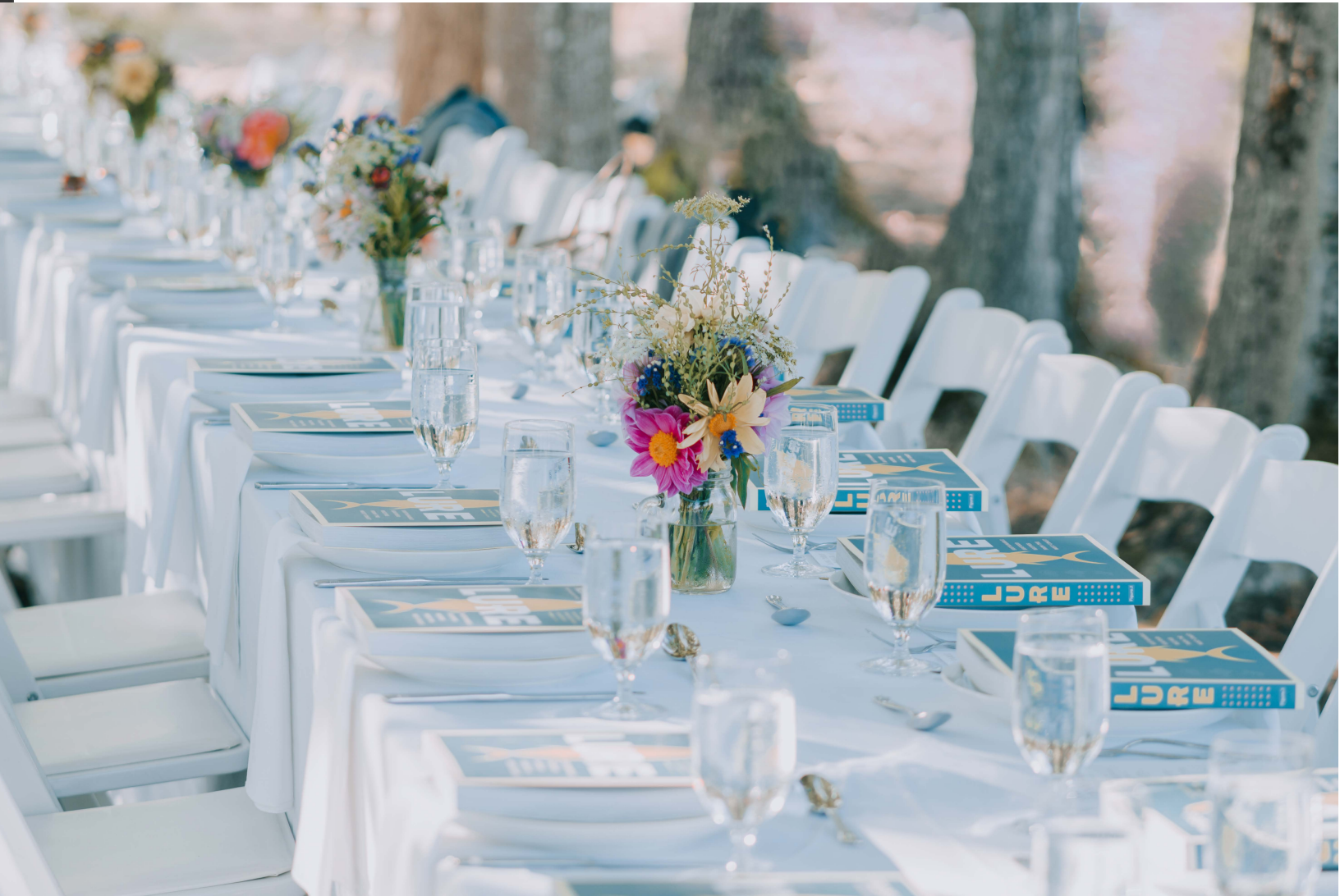
A classic summer long table dinner in the poplar grove